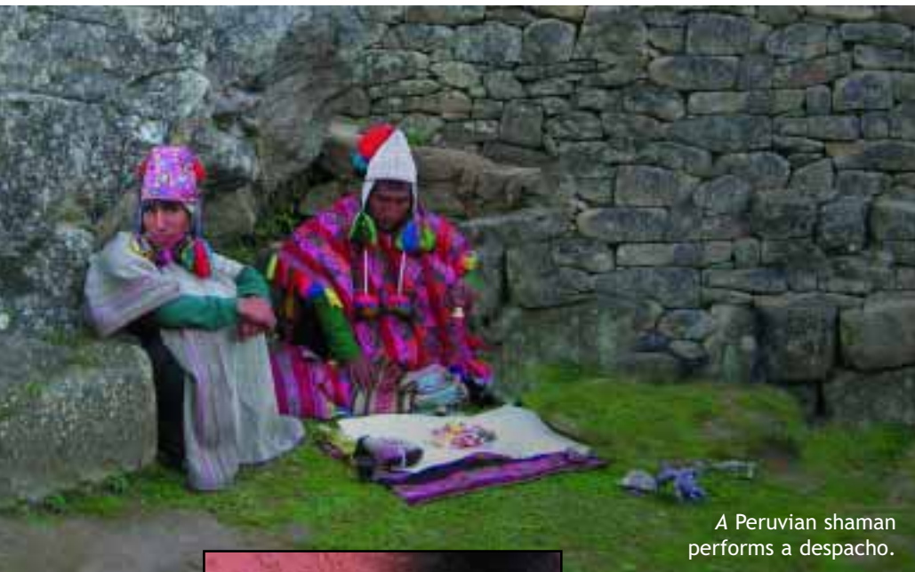
A Peruvian shaman performs a despacho.

A shaman says 'thank you' first! - quite different from the way we Westerners were